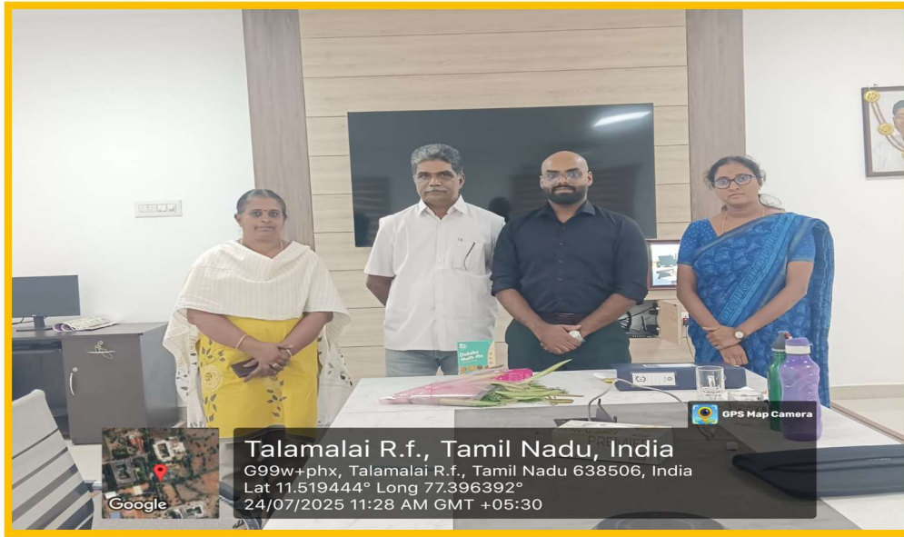
Talamalai R.f., Tamil Nadu, India G99w+phx, Talamalai R.f., Tamil Nadu 638506, India Lat 11.519444° Long 77.396392° 24/07/2025 11:28 AM GMT +05:30