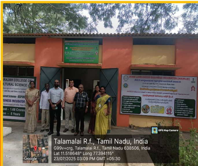
Talamalai R.f., Tamil Nadu, India G99v+crg, Talamalai R.f., Tamil Nadu 638506, India Lat 11.518648° Long 77.394115° 23/07/2025 03:09 PM GMT +05:30