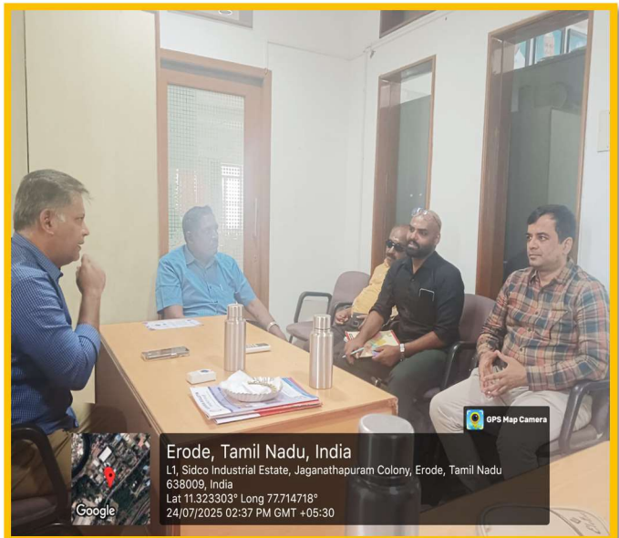
Erode, Tamil Nadu, India L1, Sidco Industrial Estate, Jaganathapuram Colony, Erode, Tamil Nadu 638009, India Lat 11.323303° Long 77.714718° 24/07/2025 02:37 PM GMT +05:30