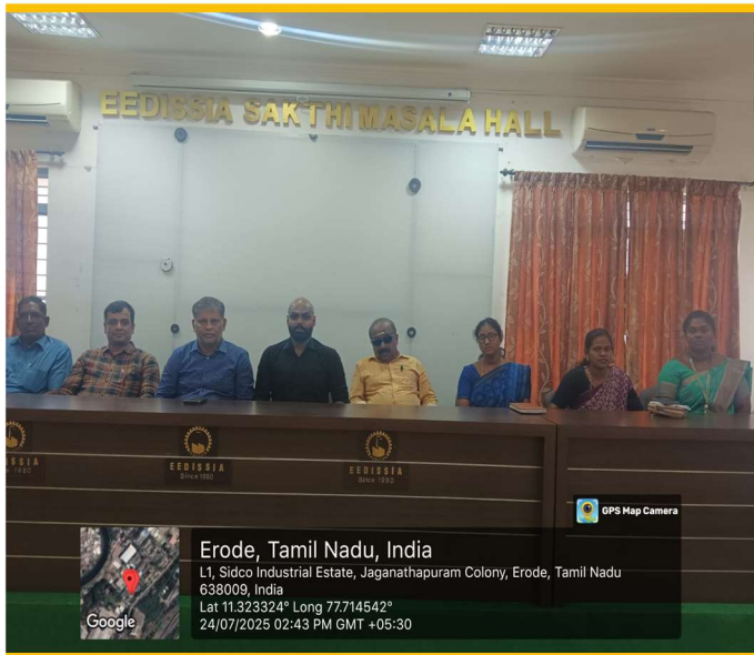
Erode, Tamil Nadu, India L1, Sidco Industrial Estate, Jaganathapuram Colony, Erode, Tamil Nadu 638009, India Lat 11.323324° Long 77.714542° 24/07/2025 02:43 PM GMT +05:30